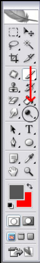
After step 2